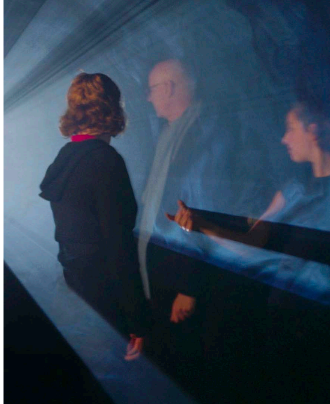
Anthony McCall, Line Describing a Cone , 1973, installation view, Whitney Museum of American Art, New York, 2001.

More information: courtauld.ac.uk/ma-contemporary-art-and-the-moving-image