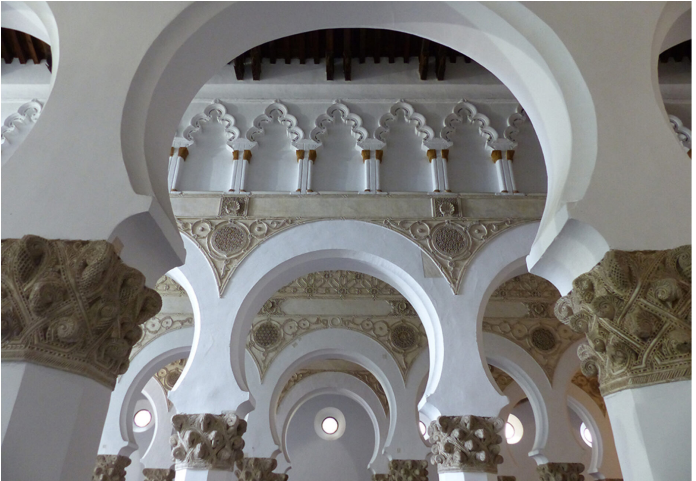
Image: Ibn Shoshan Synagogue (now the Church of Santa María la Blanca), first built 1180, Toledo, Spain