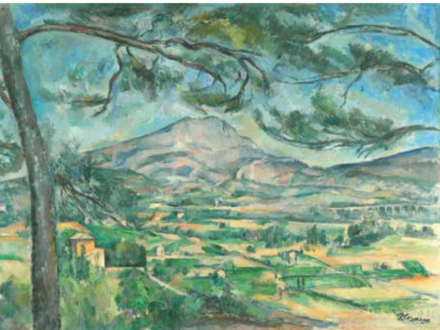
Paul Cézanne (1839-1906), The Montagne Sainte-Victoire with a Large Pine, around 1887, The Courtauld, London (Samuel Courtauld Trust)