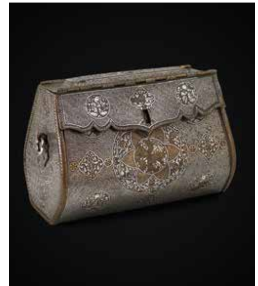
Mosul, Northern Iraq, metalworker, Metalwork bag, 1300-1335 (early 14th century), The Courtauld, London (Samuel Courtauld Trust)