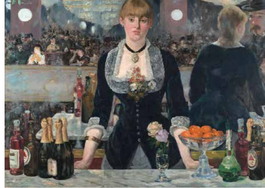
Édouard Manet (1832 - 1883), A Bar at the Folies-Bergère, 1882, The Courtauld, London (Samuel Courtauld Trust)