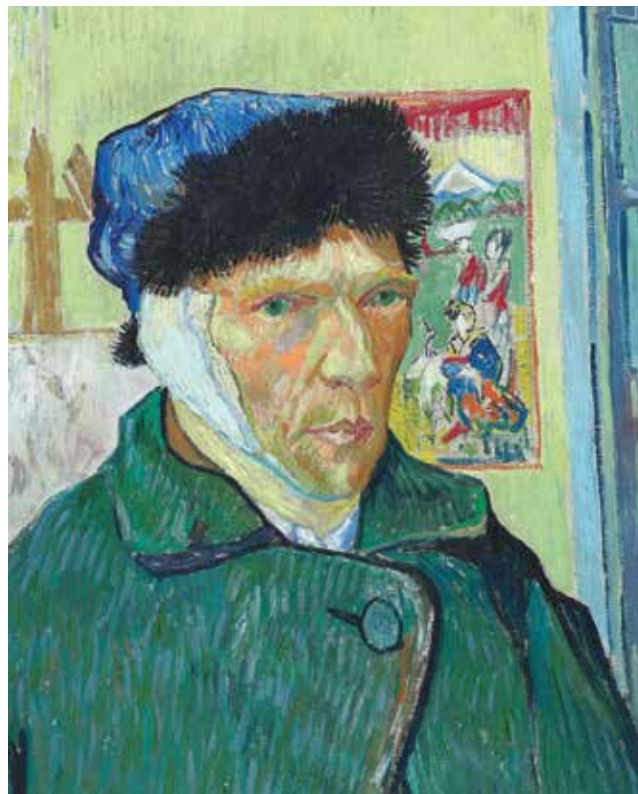
Vincent van Gogh (1853-1890), Self-Portrait with Bandaged Ear, 1889, The Courtauld, London (Samuel Courtauld Trust)