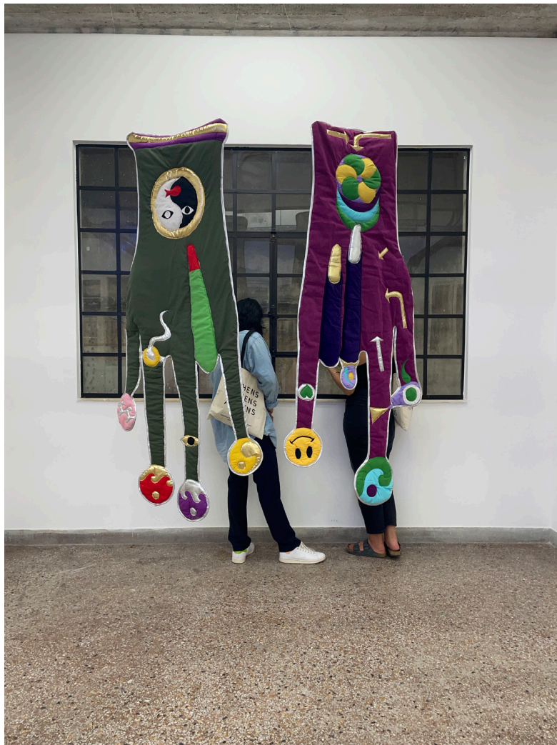
Visit at Haus N exhibition space - artwork by Angelo Plessas