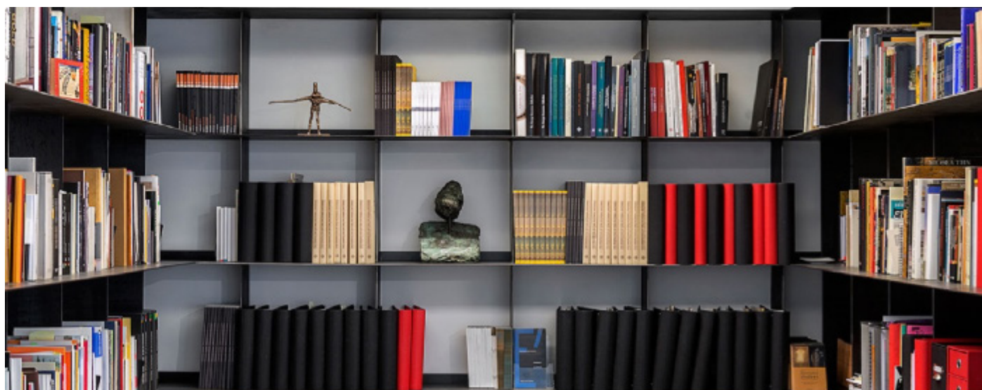
Library space of 16 Fokionos Negri.

The initiative constitutes a not for profit entity. The venue serves as a welcoming hub for hosting art exhibitions, organising cultural events, developing collaboration networks, partnerships and exchanges with other cultural organisations. Through its activities, “16 Fokionos Negri” has become established as a point of reference for the arts in Athens today, playing an active role in the cultural life and expression of the city.