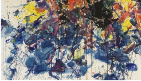
On long-term loan to The Courtauld, London (Samuel Courtauld Trust) © Sam Francis Foundation, California / DACS 2021

https://www.youtube.com/watch?v=jE1Ms5GFF0