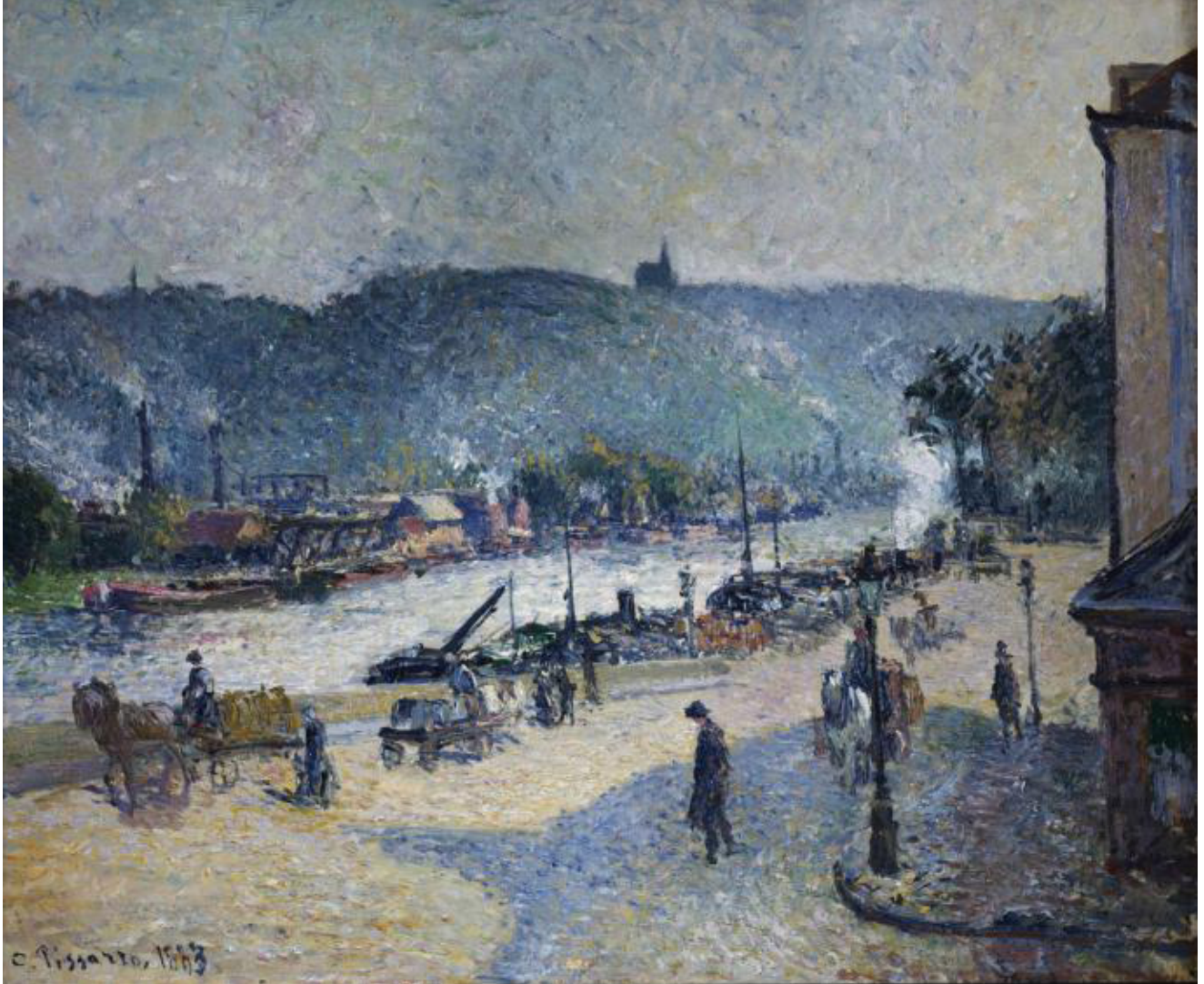
† Camille Pissarro (1830-1903), Place Lafayette, Rouen, 1883, Oil on Canvas, 46.3 x 55.7cm, (Samuel Courtauld Trust)

This painting is by Camille Pissarro (1830 -1903) who wanted his paintings to capture the reality of everyday life. The painting captures the view from a hotel room where Pissarro was staying, looking down on the street below from his window. Pissarro is often associated with a group of artists working at the same time, who were known as the Impressionists. These artists choose to break from the traditional style of painting taught in France at the time and wanted to focus on giving an impression of a scene.