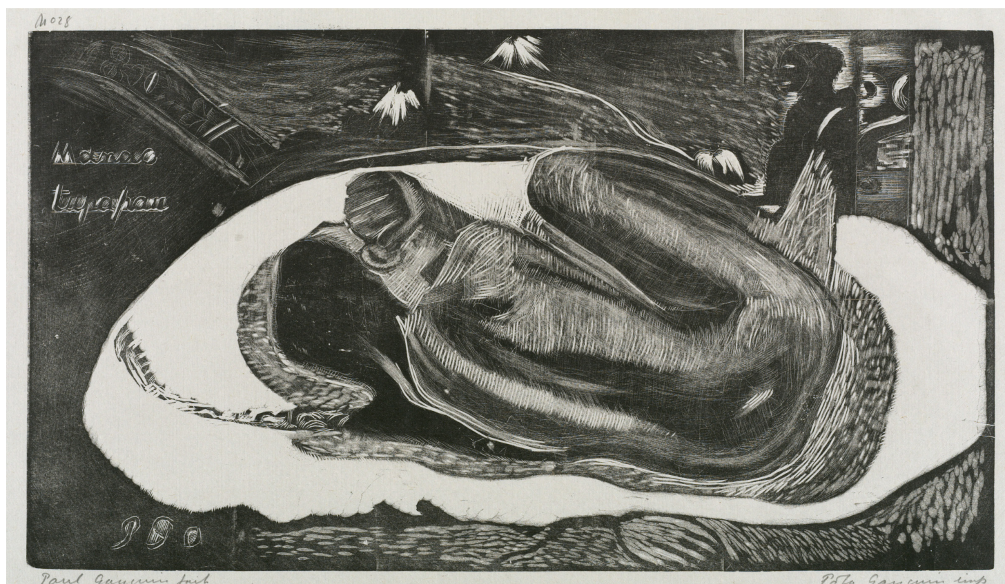
Paul Gauguin, Manao Tupapau (1893-94)

Paul Gauguin (1848-1903) was a French Post-Impressionist artist who spent ten years living on the Pacific island of Tahiti. There, fascinated by Tahitian mythology and a way of life that contrasted dramatically with European society at the time, he created Noa Noa , a series of ten woodblock prints.