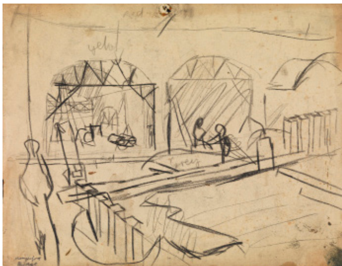
Frank Auerbach, Study for Shell Building Site – Workmen under Hungerford Bridge (c.1958)

“ I don't copy drawings, they remind me of what I saw so that I can re-imagine it as a sculpture, as architecture... ”