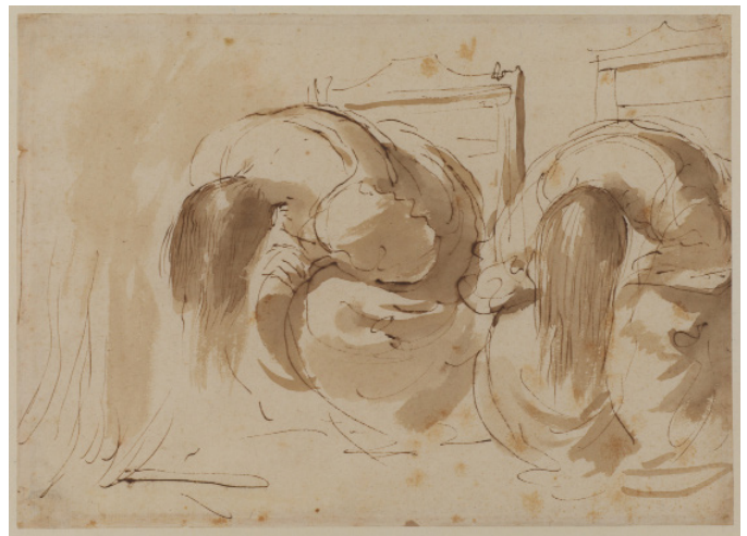
Giovanni Francesco Barbieri, Two seated women drying their hair (c.1635)

Yes, there are a lot of good drawings in the world... The actual idiom of paintings is definitely changed. Drawing seems independent of time. Nobody could mistake a 21st century painting for a 15th century