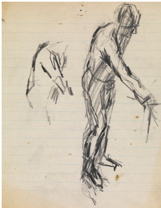
Frank Auerbach, Figure Study for Oxford Street Building Site (c.1958-59)

The process is, basically, I go outside and do a scribble. It feels as though I'm drawing for five minutes, but if I look at my watch, I find that I've been out for 35 or 45 minutes. And then what happens is that I look at the drawing, and I remember what it was that I reacted to. I haven't got much of a visual memory, I realise, with the passage