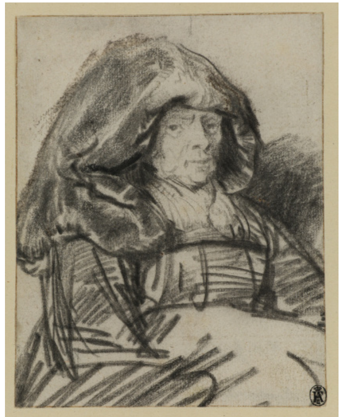
Rembrandt, Old woman with a large head dress (c.1630-40)

of time, and as I'm coming up to 88, I think it's likely that that is the case.