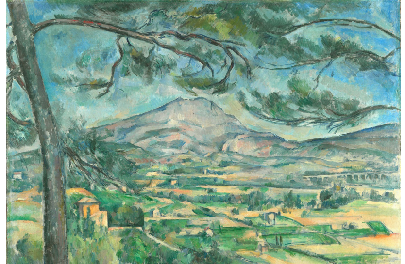
↑ Paul Cézanne (1839-1906), Montagne Sainte-Victoire with Large Pine, around 1887, Oil on canvas, 66.8 x 92.3cm, The Courtauld, London (Samuel Courtauld Trust)

In the background there are mountains and rocks .