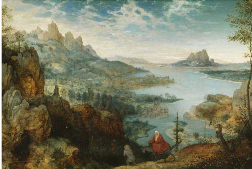
↑ Pieter Bruegel the Elder (around 1525- 1569), Landscape with the Flight into Egypt, 1563, Oil on Canvas, 37.1 x 55.6 cm, The Courtauld, London (Samuel Courtauld Trust)

This painting was made by the artist Pieter Bruegel the Elder in 1563 .