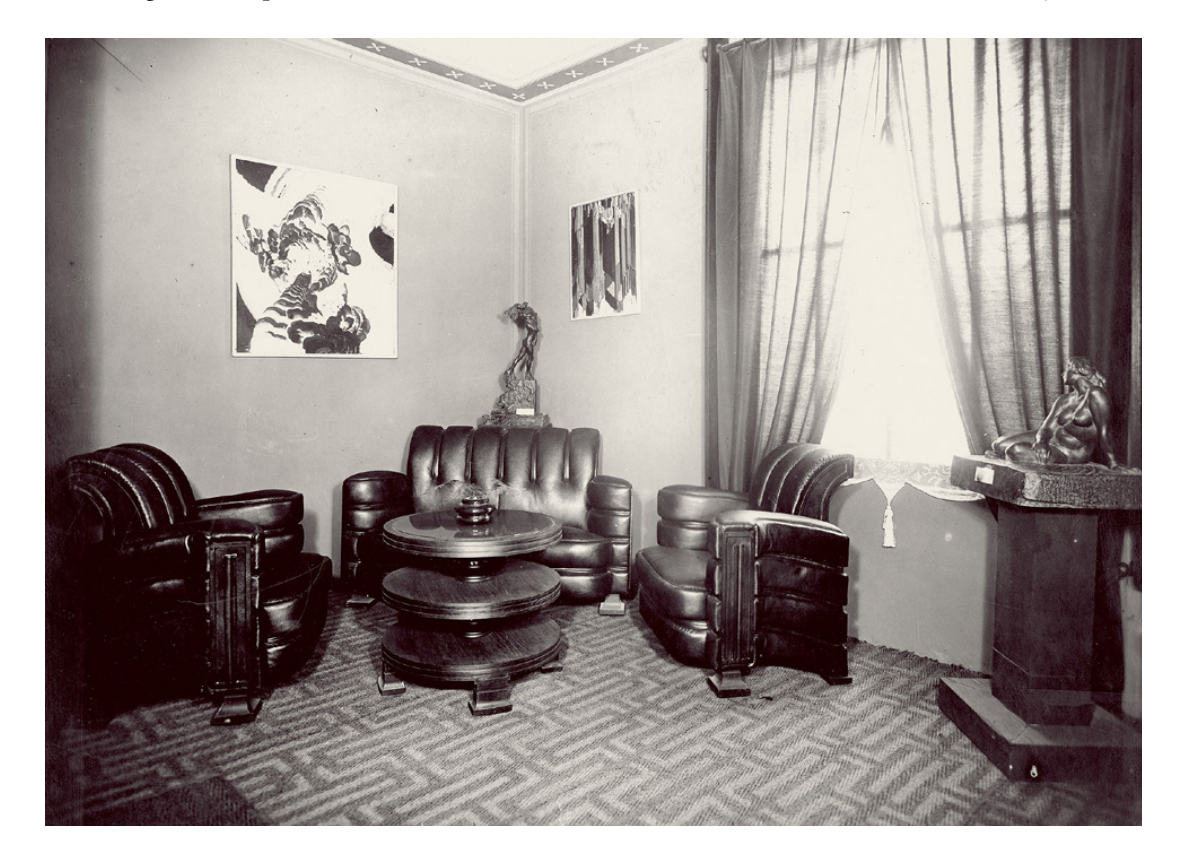
Fig. 6.1. The smoking lounge for the Czechoslovak exposition at the International Exhibition of Modern and Decorative Arts in Paris (1925). Black-and-white photograph. Museum of Decorative Arts, Prague.

Both pictures were Kupka's own property at this time, and Study for the Language of Verticals from 1911 had not even been exhibited yet.<sup>20</sup> Kupka would thus have had to supply the pictures to the organisers of the Czechoslovak exposition himself. But why and at what stage of the preparations? We know that in the original conception for the exposition, as documented in its catalogue, these pictures were not included. The first constructive clues were ultimately offered