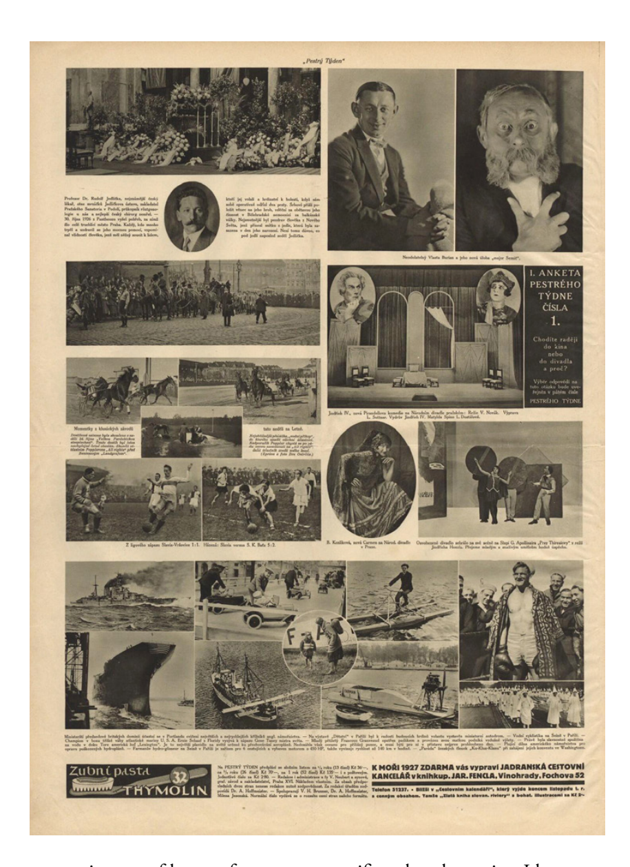
Fig. 25.1. Photo layout from Pestrý týden (Colourful Week), no. 12 (1928).

comparison or of loose reference to a specific cultural practice. I became aware of this in relation to my primary interest here, the analysis of Jiří Kolář's early collage work. Simply asserting these collages' affinity with film technique seemed inadequate to me, and I could not establish a more precise connection with film. While these collages do not constitute typical fine-art or literary works, they do remain tangible, pictorial artefacts far removed from the nature of film. The image may play an important role in film too, but we are dealing with an audio-visual and temporal art with its own specific effects. The creation of a new idea by means of the confrontation of two film shots or of two photographs is, despite a certain similarity, a very different process. How would I find a way out of such difficulties?