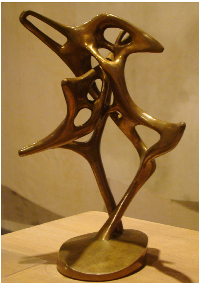
Fig. 12.3. Maria Jarema, Dance ( Taniec , 1955). Brass, height 26 cm. National Museum in Kraków.