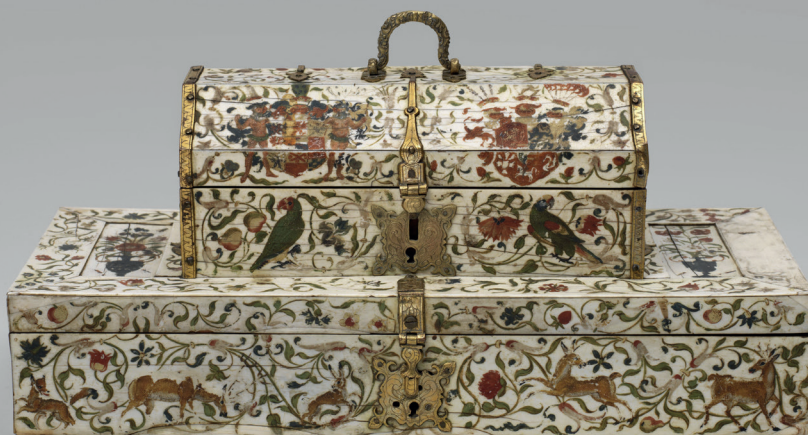
Ivory mounted wood casket painted with flowers, birds and animals, 1600-99, © The Samuel Courtauld Trust, The Courtauld Gallery, London