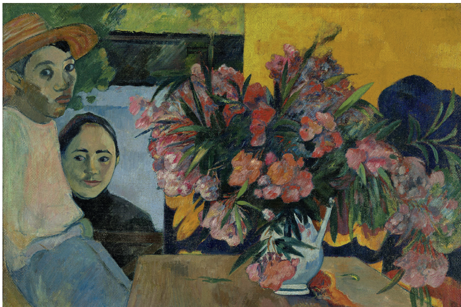
Paul Gauguin, Te Tiare Farani (The Flowers of France) , 1891, © Pushkin State Museum, Moscow (3370)