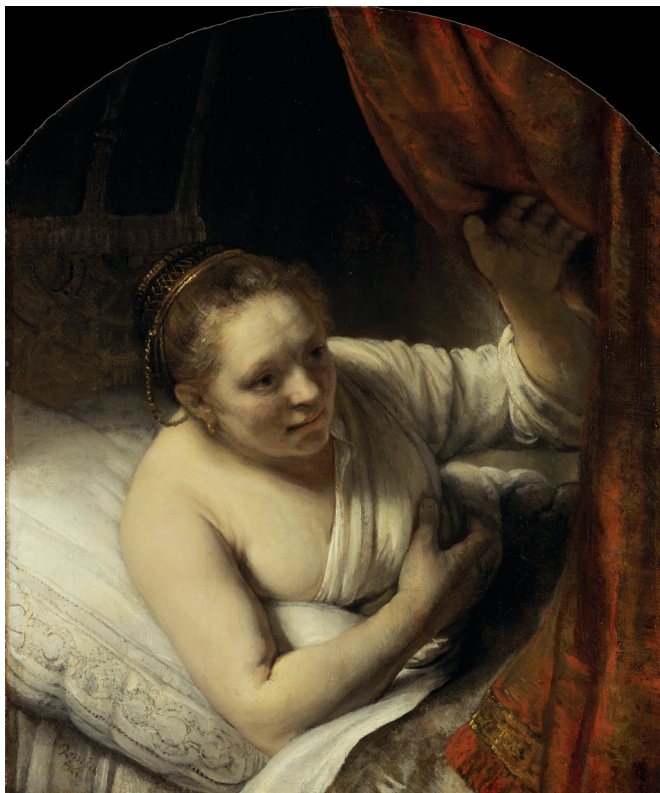
Rembrandt Harmenszoon van Rijn, Woman in Bed , Accession number NG 827, oil on canvas, 1647, Royal Galleries Scotland