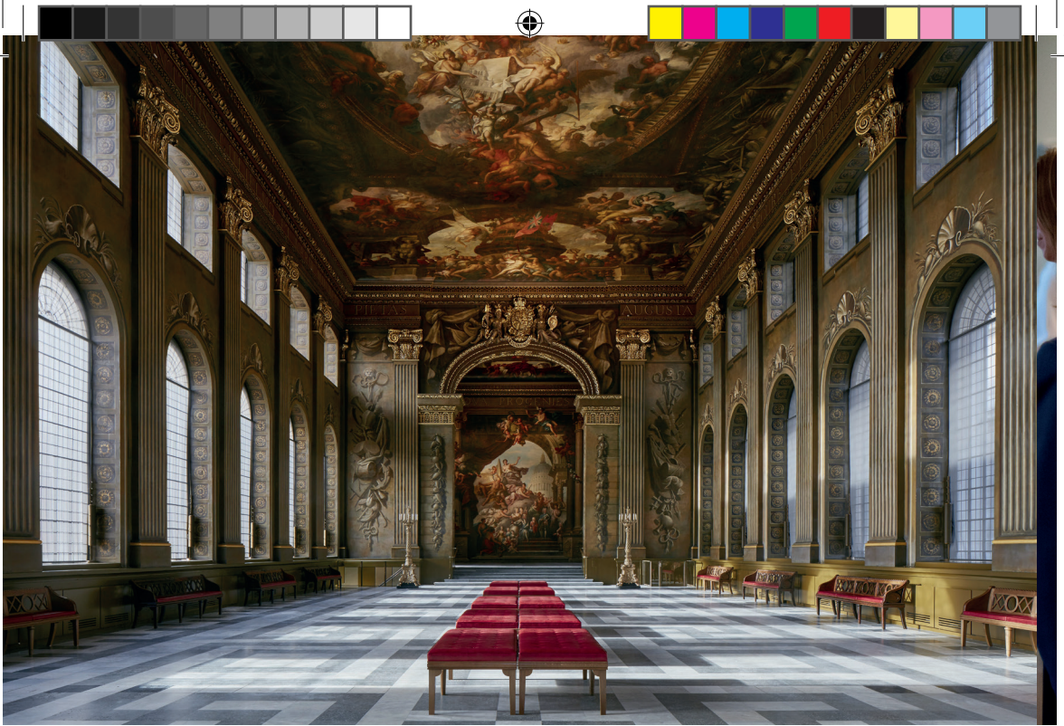
The newly reopened Painted Hall at Old Royal Naval College, Greenwich.