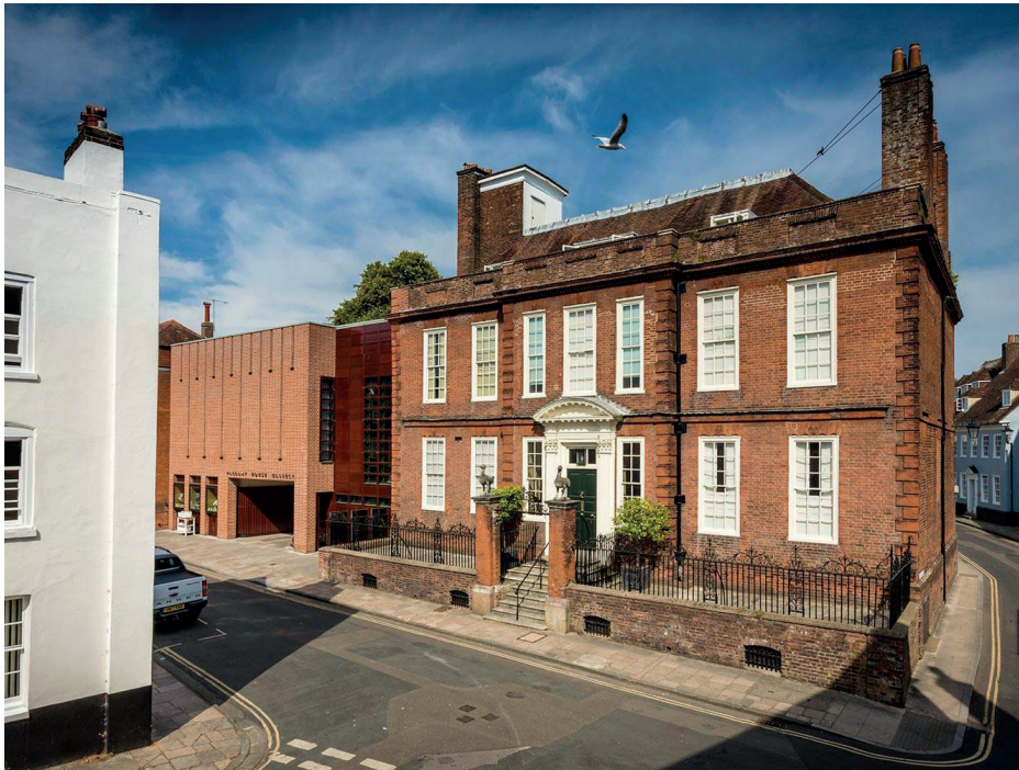
Pallant House, Chichester