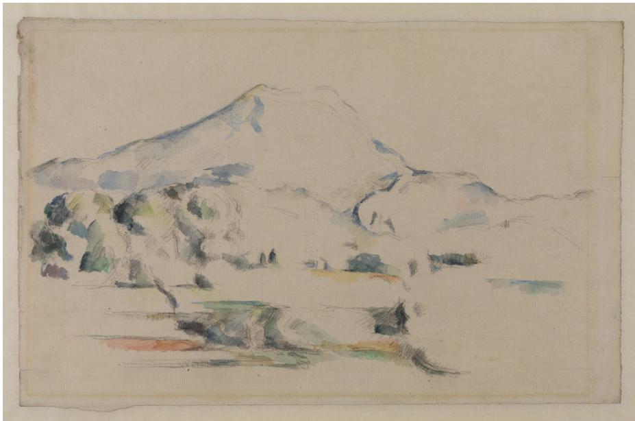
Paul Cézanne, La Montagne Saint-Victoire, 1885-1887