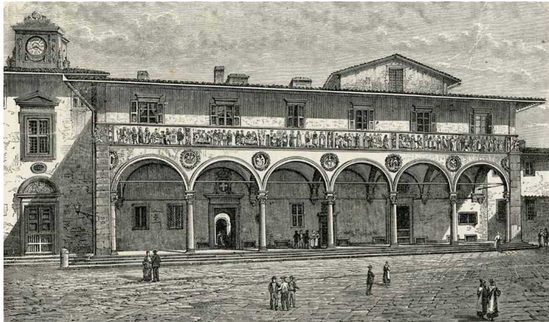
Fig. 8.1 The façade of the Ospedale del Ceppo in Gustavo Strafforello's La Patria, Geografia dell'Italia: Provincia di Firenze (Turin: Unione Tipografico- Editrice, 1894).

When John Ruskin visited the Italian city of Pistoia in 1845, he found himself simultaneously distressed by and in awe of the colourful glazed terracotta frieze adorning the façade of the Ceppo Hospital (figs 8.1–8.3). In a letter to his father, Ruskin wrote: