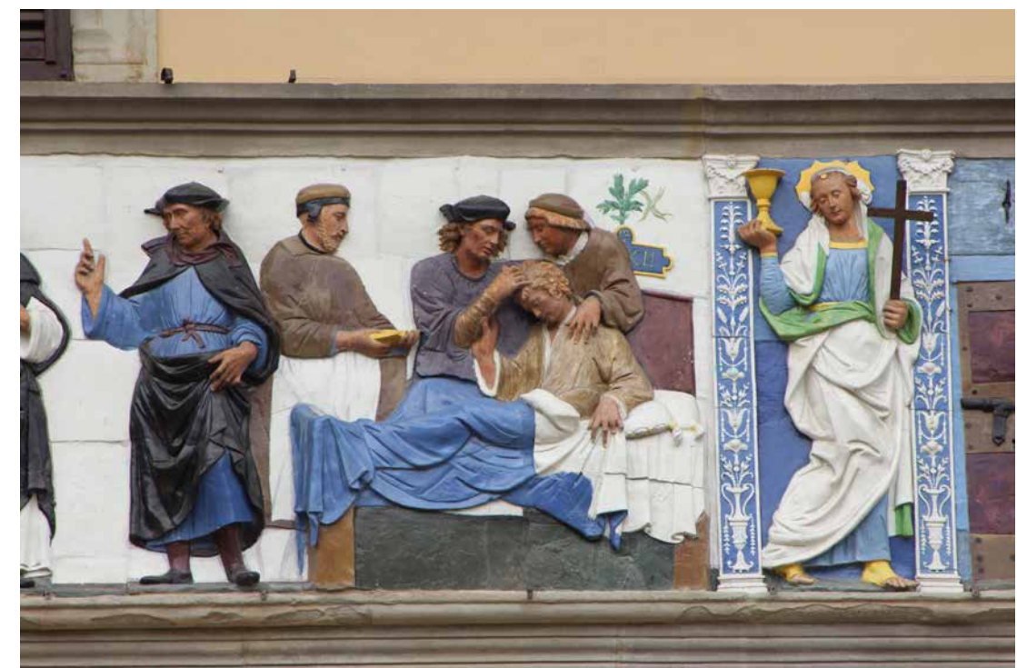
Fig. 8.6 Santi Buglioni, detail of hospital patient and employees in Caring for the Sick (1526–1529). Glazed terracotta. Ospedale del Ceppo, Pistoia.

Renaissance hospitals provided a wide variety of charitable and social services, and the length and complexity of the frieze reflects the breadth of the Ceppo's mission: not only did it employ physicians and medics to look after the infirm, but it also provided clothes, food, and financial assistance to different groups of disadvantaged citizens. 14 Fittingly, the bodies represented on the frieze are engaged in a similar diversity of charitable activities. For example, in the first section