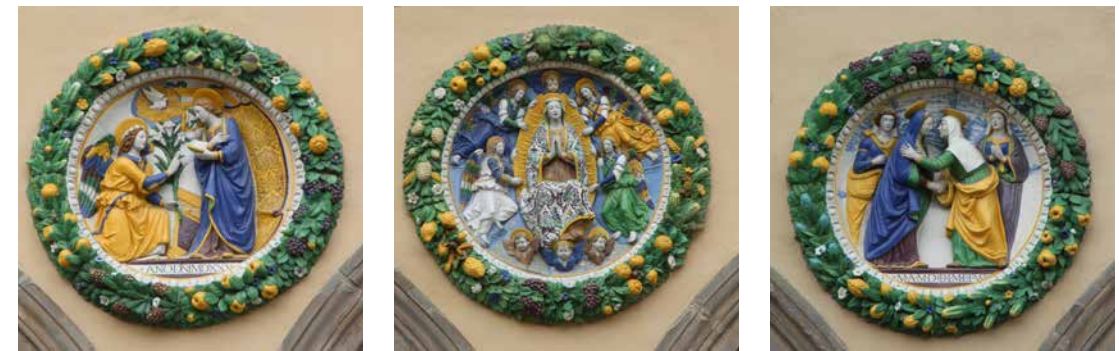
Fig. 8.19 (left) Giovanni della Robbia, The Annunciation (1525–1529). Glazed terracotta. Ospedale del Ceppo, Pistoia.