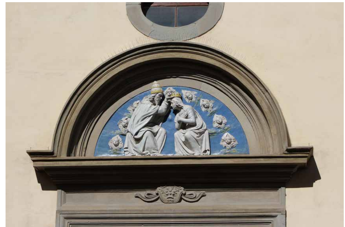
Fig. 8.22 (bottom) Benedetto Buglioni, The Coronation of the Virgin (1510– 1512). Glazed terracotta. Ospedale del Ceppo, Pistoia.

It is the medium itself that provides a sense of unity and cohesion to the hospital's exterior decoration. The roundels underneath the works of mercy, for example, invite a viewer to complement a horizontal, narrative reading of the frieze with vertical readings that stress local and institutional identity: the images of the Virgin refer to her role as patron saint of the hospital, while the coats of arms of the city and the hospital indicate the centrality of these charitable works to the life of Pistoians. The wide diversity of bodies represented in the frieze and the civic identity reflected in the roundels, furthermore, underline the importance of community, both with Christ and with one's neighbours, to Christian life.