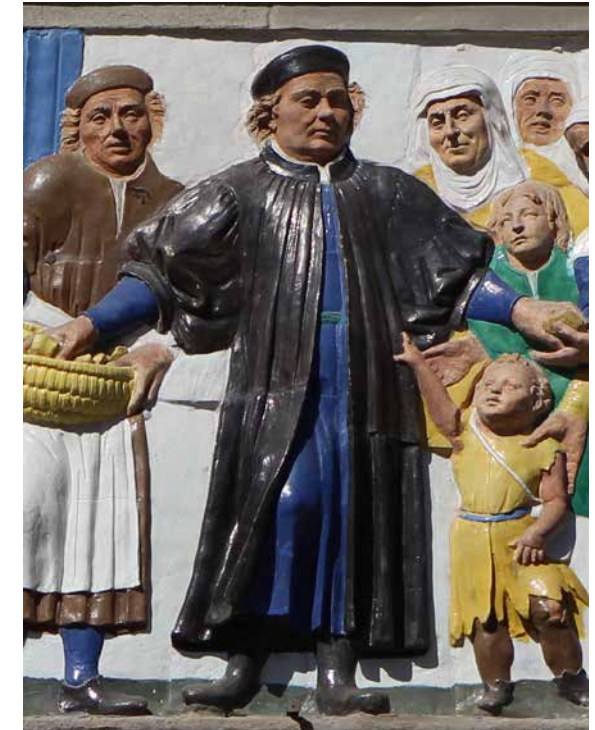
Fig. 8.4 (left) Santi Buglioni, detail of Leonardo Buonafede in Clothing the Naked (1526–1529). Glazed terracotta. Ospedale del Ceppo, Pistoia.