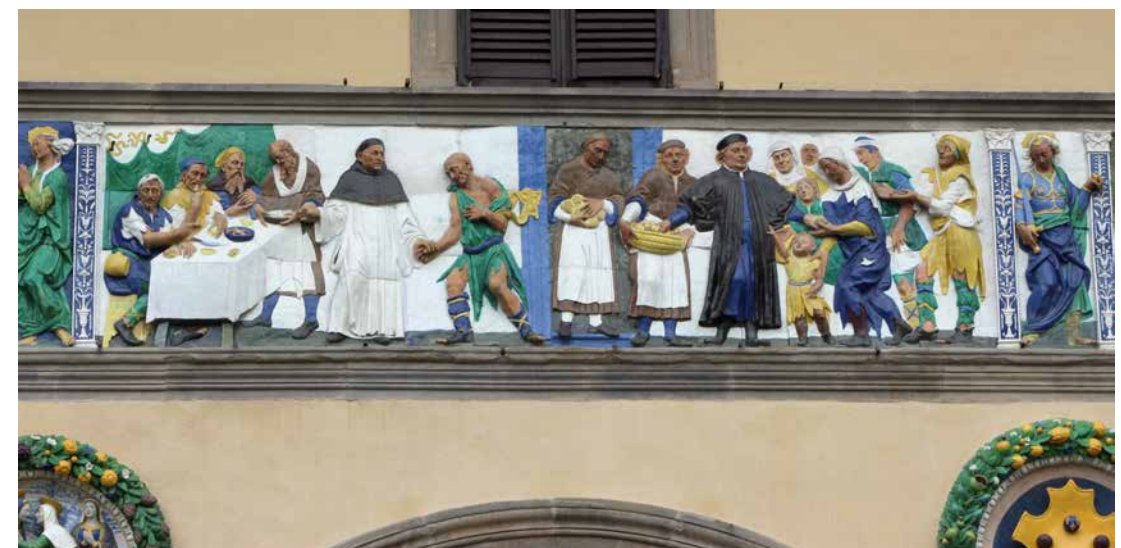
Fig. 8.10 Santi Buglioni, Feeding the Hungry (1526–1529). Glazed terracotta. Ospedale del Ceppo, Pistoia.

The repetition of Buonafede across the façade not only underlines the contemporaneous nature of the imagery, but it also makes possible a reading of the frieze as a continuous narrative. Buonafede in particular acts as a familiar visual anchor, his body serving as a means of both dividing and enlivening the long horizontal fields allocated to each work of mercy. The inclusion of Christ and several saints within these seemingly contemporary represented spaces is, therefore, all the more striking, as is the presence of five female bodies dividing the six large scenes on the main façade, easily identifiable by their familiar attributes as cardinal and theological virtues: