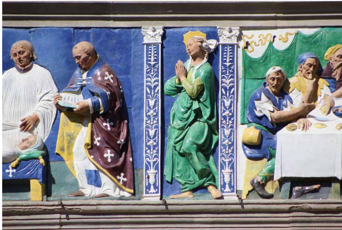
Fig. 8.11 Santi Buglioni, Hope (1526–1529). Glazed terracotta. Ospedale del Ceppo, Pistoia.

from left to right, Prudence , Faith , Charity , Hope , and Justice . Although these figures are distinguished by the presence of haloes—only Charity , at the centre of the façade, lacks one—their general similarity in appearance to the sixteenth-century Tuscans among whom they appear must be intentional: all are depicted in high relief and with exposed flesh unglazed.