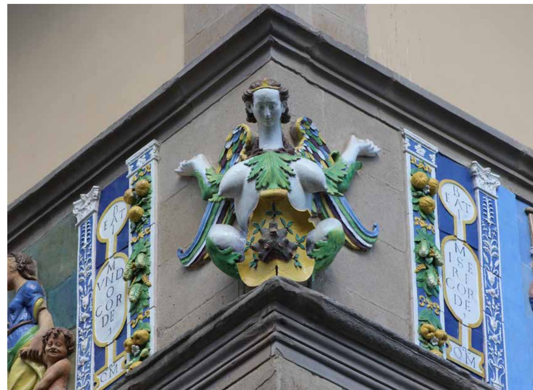
Fig. 8.15 Santi Buglioni, glazed terracotta decorations (1526–1529) at the western corner of the façade of the Ospedale del Ceppo.

The division of the beatitudes into incomplete phrases may be a matter of spatial consideration, but it also has the effect of stressing the continuity of the frieze. The fragmentary nature of the inscriptions encourages a viewer to search for their endings, even though in the case of the second beatitude there is none to be found. The inclusion of text within a cycle of images, furthermore, invites a careful reading of the frieze as a whole, and it structures this reading in a Latinate textual direction from left to right, beginning on the western short side of the loggia and ending at the far right of the main façade. Despite this apparent interest in text, however, the seven works of mercy do not follow the order in which they are mentioned in the Gospel of Matthew. It seems plausible that the hospital re-ordered the works in order to emphasise the charitable activities of which it was most proud: this would explain the particularly prominent