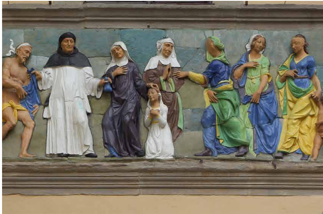
Fig. 8.3 [detail] Composite image of Santi Buglioni's frieze at the Ospedale del Ceppo, Pistoia (1526–1529). Glazed terracotta.

to Renaissance Pistoia: it was the largest hospital in the city and by the fifteenth century boasted seventy beds for the sick. 8