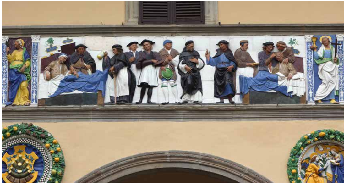
Fig. 8.7 Santi Buglioni, Caring for the Sick (1526–1529). Glazed terracotta. Ospedale del Ceppo, Pistoia.