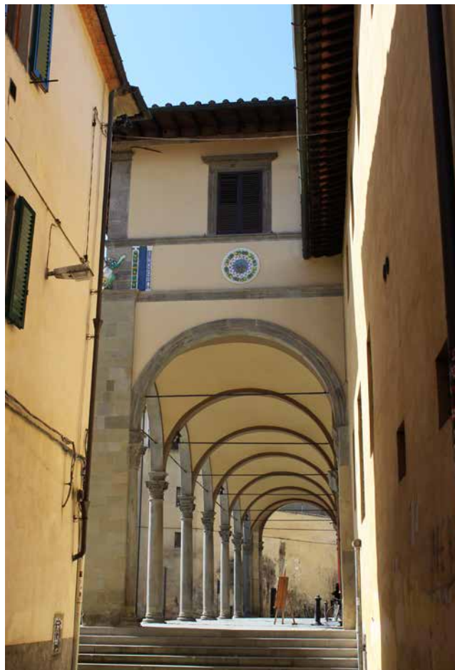
Fig. 8.17 View of the loggia of the Ospedale del Ceppo from the east (2018).

bably discarded because of problems that developed during the firing: glaze defects and cracking are visible throughout.