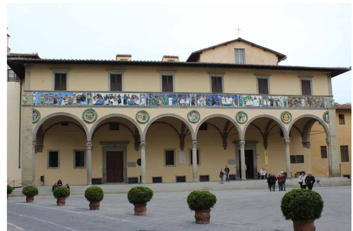
Fig. 8.2 The façade of the Ospedale del Ceppo (2018).

The works of mercy were a natural choice for the decoration of charitable institutions in Renaissance Italy, yet Buglioni's medium and exterior setting allowed him to communicate the subject matter in a newly prominent, visually striking way. Surviving Tuscan precedents that Santi likely knew and referred to include the Allegory of Divine Mercy (1341–1342) in the Confraternity of Santa Maria della Misericordia (now the Bigallo) in Florence, the fresco cycle of the Pellegrinaio of Santa Maria della Scala (1440–1445) in Siena, and the lunettes (c.1478–1479) in the Oratory of San Martino dei Buonomini in Florence. 6 Notably, these are painted and decorate enclosed spaces, making them less immediately visible in their urban contexts. 7 The saturated colours of Buglioni's glazed terracotta surfaces instead contrast strongly against the matte stone and painted plaster of the Ceppo's loggia, attracting a viewer's eye as he or she approaches from the south or west. Thanks to the inherent durability of Buglioni's technique, the Ceppo frieze has endured largely intact for nearly five centuries; even rain simply washes away accumulated grime, revealing the brilliant surfaces of the sculpture. Buglioni's programme thus addresses not only the members and guests of a specific institution—in this case, a hospital—but also the entire city. The size and prominence of the frieze, furthermore, signal the centrality of this institution