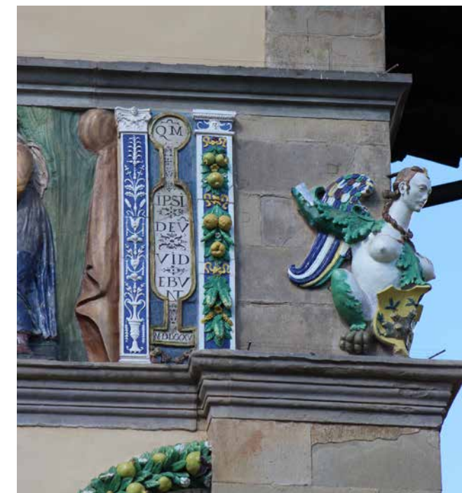
Fig. 8.16 Santi Buglioni and Filippo di Lorenzo Paladini (attr.), glazed terracotta decorations (1526–1529 and 1585) at the eastern corner of the façade of the Ospedale del Ceppo.

It remains uncertain why this last scene is a later work by a different hand, although there is evidence that Buglioni at the very least attempted to complete the cycle himself. In 1934, excavations underneath the Ceppo recovered a large group of fragments of partially-glazed terracotta sculpture: the quality of the glazes and clays, as well as the style of the reliefs, indicates that these were made by Buglioni and his shop. 27 One large fragment depicts a poor man holding out a jug, with another vessel in the background, and for this reason it is likely that the subject matter was the seventh work of mercy, Giving Drink to the Thirsty . The fragments were pro-