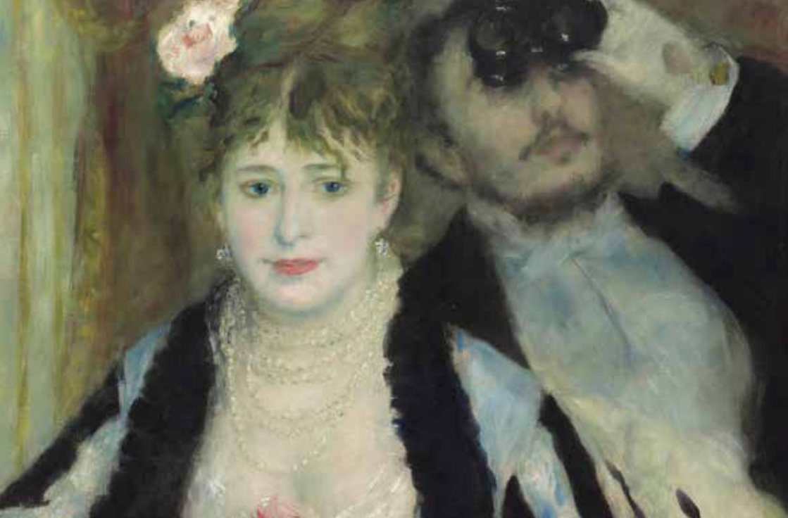
Pierre-Auguste Renoir La Loge