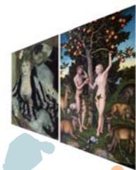
3 Renoir La Loge 4 Cranach Adam and Eve 5 Kandinsky Red Circle