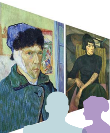
1 Van Gogh Self Portrait with Bandaged Ear 2 Roger Fry Portrait of Nina Hamnett

The Friends of The Courtauld Institute of Art is a registered charity, charity number 312911.