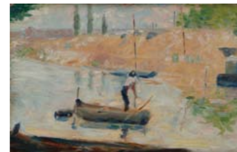
Georges Seurat Man in a Boat

This display explores some of the exceptional new additions to The Courtauld's collection since it moved to Somerset House twenty years ago. Highlights include works ranging from Turner and Constable to Ingres, Degas and Seurat. It will also unveil one of the most important new acquisitions, Joshua Reynolds's late masterpiece Cupid and Psyche .