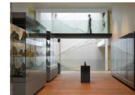
The Art from the Islamic World gallery

Following the tour guests can stay for lunch or continue to enjoy the galleries at their leisure or visit other important Oxford art institutions such as Modern Art Oxford.