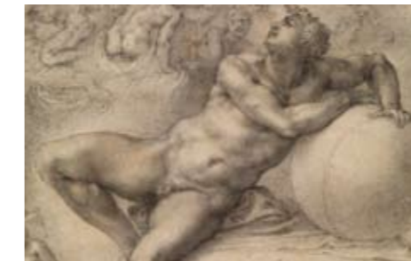
Michelangelo Buonarroti The Dream (Il Sogno) c.1533 (detail)

The Courtauld Gallery For: Patrons' Circle and Director's Circle