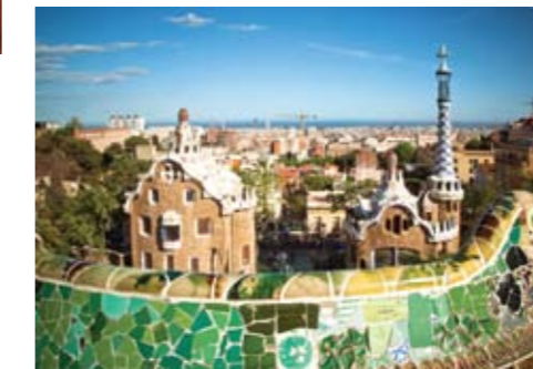
Güell park, designed by Antonio Gaudí is the most famous park in Barcelona, declared a World Heritage Site by UNESCO.

A full programme and details of travel arrangements and costs will be available in March 2010. Please register your interest on the booking form.