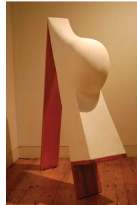
Phillip King Drift circa 1961 © The Samuel Courtauld Trust, The Courtauld Gallery, London/Philip King

For: Patrons' Circle and Director's Circle