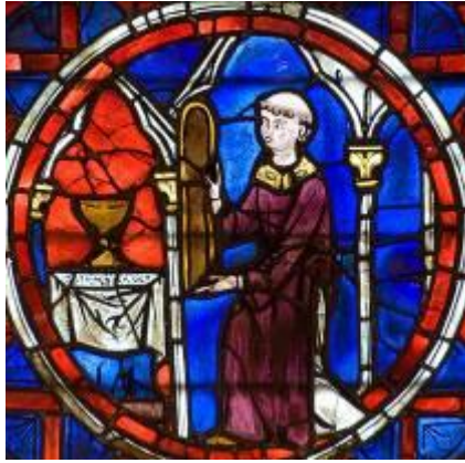
Fig. 10 - Le Mans Cathedral, Bay 109, Panel C1

One may contrast this example with various windows appearing in donation scenes in the surviving 13 th -century glass at Le Mans cathedral. In most cases, the offered panel is depicted without any internal detail, as in this example from bay 109 (Fig. 10), made around 1250.