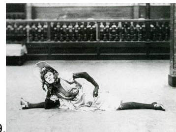
9. Unknown photographer Jane Avril at the Moulin Rouge c.1892

These images are available for editorial purposes only from: