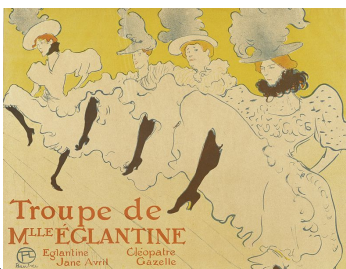
7. Henri de Toulouse-Lautrec Mademoiselle Eglantine's Troupe , 1896 Colour lithograph, 62 x 80 cm Victoria & Albert Museum