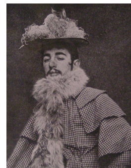
10. Toulouse-Lautrec wearing Jane Avril's hat and scarf c.1892