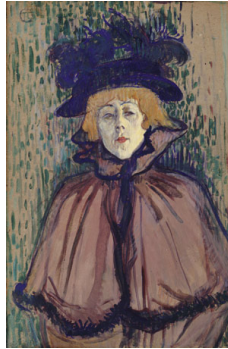
2. Henri de Toulouse-Lautrec Jane Avril , c.1891-92 Oil on cardboard, 63.2 x 42.2 cm Sterling and Francine Clark Art Institute Williamstown, Massachusetts