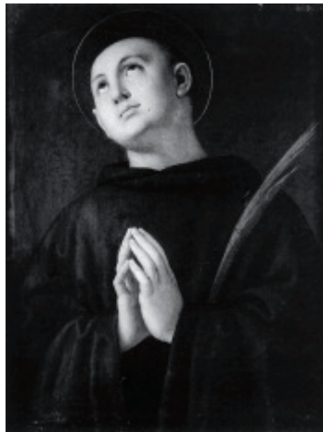
26. St Placidus , by Sassoferrato, after Perugino. 1625–50. Canvas, 63 by 50 cm. (Monastero di S. Pietro, Perugia).