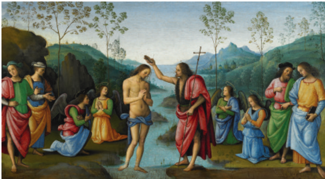
17. Baptism of Christ , by Perugino. 1495–1500. Panel, 39 by 68 cm. (Musée des Beaux-Arts, Rouen).

flared-up again in winter 1906–07 and once more provided the pretext for an attack on the Gallery's direction. The publication of a new edition of the catalogue of the foreign schools, which maintained the association with Perugino, prompted Maurice Brockwell to write three articles for the Athenaeum . 16 They provoked a series of letters and articles, both in the weekly itself and subsequently in The Times , all written with the polite deference typical of the period, thinly disguising the vitriol. Such was the response that the editor of the Athenaeum was forced to add an exasperated plea on 16th February 1907, entreating his readers that 'Further correspondence on this subject is not invited'. These articles are marked by their insistence that the painting was a modern forgery, completely rejecting Horne's suggestion that it could be an early copy. The position adopted by their authors was political: their desire for the painting to be a fake was used to justify a low opinion of Poynter's expertise.