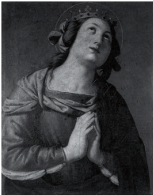
21. St Flavia , by Sassoferrato, after Perugino. 1625–50. Canvas, 63 by 50 cm. (Monastero di S. Pietro, Perugia).

del '. 42 Yet within this broad market, Sassoferrato stands alone, for not only did he copy, but he created an aesthetic based on emulation and imitation. In this sense, he was unique.