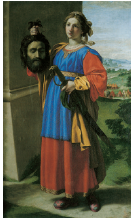
22. Judith , by Sassoferrato. 1625–50. Canvas, 160 by 85 cm. (Monastero di S. Pietro, Perugia).