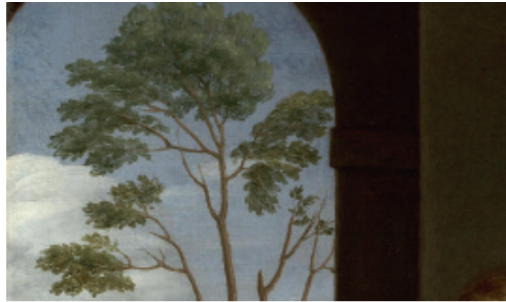
24. Detail of trees in The Virgin and Child embracing , by Sassoferrato. 1660–85. Canvas, 97.2 by 74 cm. (National Gallery, London).

canvas. By the time Sassoferrato came to copy these figures the altarpiece had been dismantled, following the reorganisation of the church in 1591 by Valentino Martelli, and the predella panels, including the narrative scenes of the Adoration , the Baptism and the Resurrection , had been moved to the sacristy. Sassoferrato's copies after Perugino show Scholastica , Maurus , Placidus and Flavia (Fig.21). 52 They are almost double the size of the original and on canvas rather than panel. 53 He evidently made careful preparatory drawings, one of which survives at Windsor (Fig.20), in such a precise manner that it would have been possible to produce a copy at some distance from the original, but for the similarity of the colouring. These pictures would seem to have served a private devotional function, hanging in the abbot's apartment and showing saints important to the community at S. Pietro, including the abbey's founder.