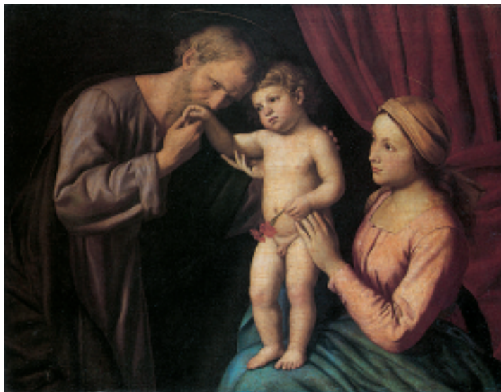
25. Holy Family , by Sassoferrato. Canvas, 73 by 95 cm. (Sanssouci, Potsdam).

stylistic reasons for giving the latter work to him. The particularities of the copyist's hand are evident in small deviations from Perugino's original. These are most pronounced in the trees. Although the branches follow the general pattern of the original, the leaves are broader, as if they have been flattened against the surface. They bear comparison with other works by Sassoferrato: see, for example, the tree at upper left in the background of his Virgin and Child embracing (also in the National Gallery; Fig.24), or the trees in the Virgin and sleeping Child in the Galleria Estense, Modena.