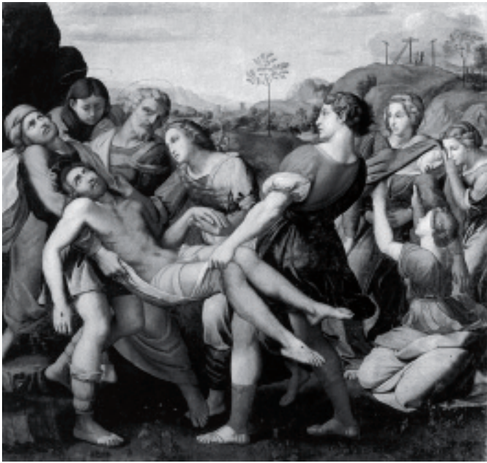
23. Entombment , by Sassoferrato, after Raphael. 1625–50. Canvas, 115 by 125 cm. (Monastero di S. Pietro, Perugia).

Another of the instances of a seventeenth-century painter copying an early fresco was also one who is now classified as stylistically retardataire . In 1655–56 Carlo Dolci was commissioned by the Marchese Scipione di Piero Capponi to copy the much-venerated miracle-working fresco of the Annunciation in SS. Annunziata in Florence. 50 As with Sassoferrato's copy of the Madonna del Giglio , Dolci's must have been prompted by the sanctity of the prototype, which was reputed to have been painted by an angel. Such replication relates to a much older tradition, of which the copying, replacement and updating of Bernardo Daddi's altarpiece in Orsanmichele is probably the most famous instance. Sassoferrato's archaism might be thought, therefore, to refer as much to his style as to the function of his imagery.