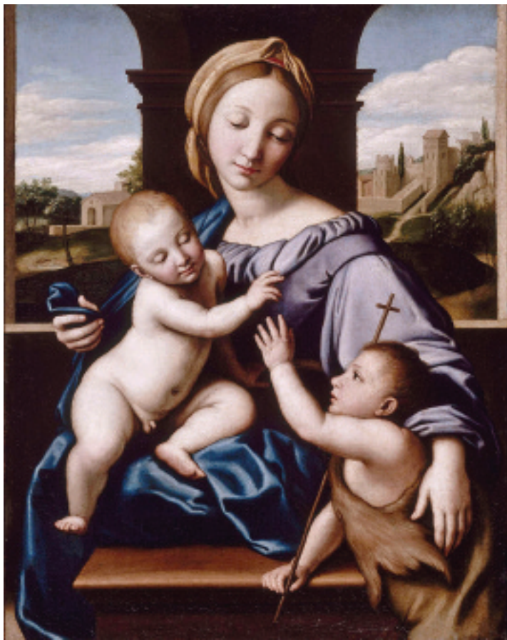
19. Virgin and Child with the Infant Baptist (The Garvagh Madonna), by Sassoferato, after Raphael. 1625–50. Canvas, 47.8 by 38.5 cm. (Musée du Louvre, Paris).