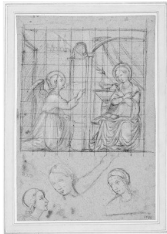
20. Annunciation, by Sassoferrato. c.1430. Black and white chalk on grey-green paper, 39.8 by 27 cm.

paintings had acquired canonical status, and copies seem to have been commissioned either because the originals were unobtainable, or to replace the originals when they had been removed from the altars they once decorated. But among these divine practitioners, Raphael was Olympian, not least because of the model he provided to those young artists pursuing a classicising style. Malvasia attributed Guido Reni's early success in part to his copy of Raphael's St Cecilia with saints (sometimes identified as the painting in the Polet Chapel, S. Luigi dei Francesi, Rome); while the copyists that Poussin oversaw for Paul de Chantelou in the 1640s were similarly replicating Raphael, including paintings in the Palazzo Farnese, the Transfiguration , then in S. Pietro in Montorio, and the Madonna di Foligno , then in S. Francesco, Foligno. 41