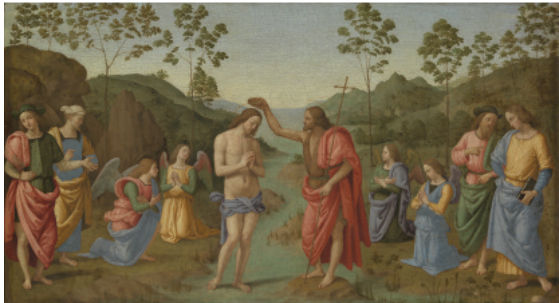
18. Baptism of Christ, after Perugino. Probably late sixteenth century. Canvas laid onto panel, 36 by 60.5 cm.