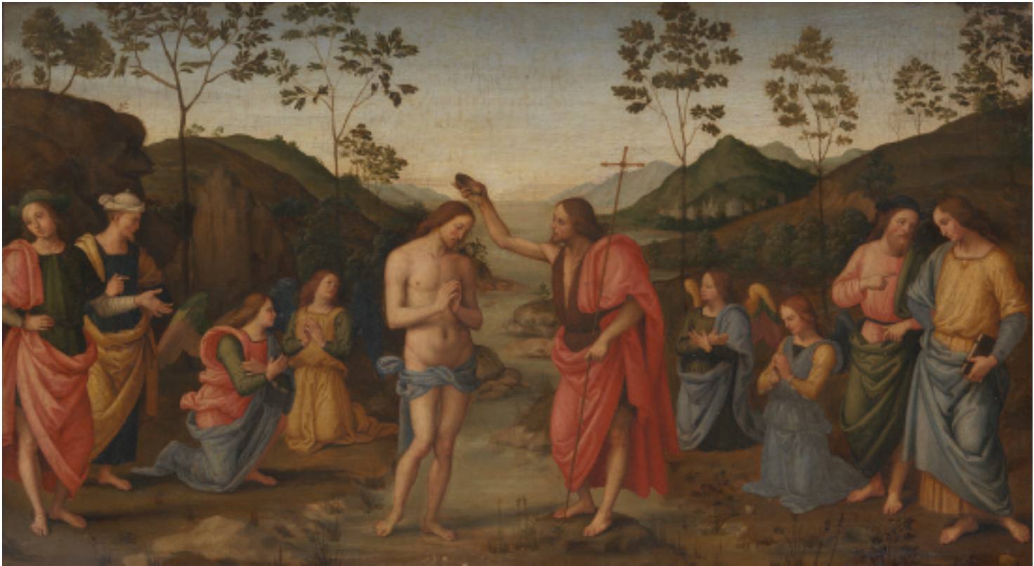
16. Baptism of Christ , after Perugino, here attributed to Sassoferrato. Second quarter of the seventeenth century. Canvas laid onto panel, 32.5 by 59 cm. (National Gallery, London).